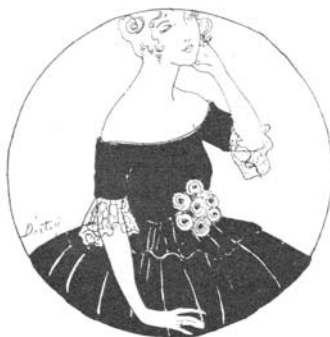
A faint echo of Victorian stays and ways is seen in the bodice and bouffant skirt of a dancing-dress with its drooping shoulders and quaint corsage bouquet. Chez Lanvin

Lanvin, Martial et Armand and a number of other French houses use the Victorian drop shoulder. In one notable instance it was seen in a frock of peach-red velvet with the bodice embroidered in antique gold and in another in hydrangea-blue taffeta with the design outlined in silver