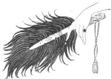
When a single feather makes a fan mounted on a stick of carved ivory