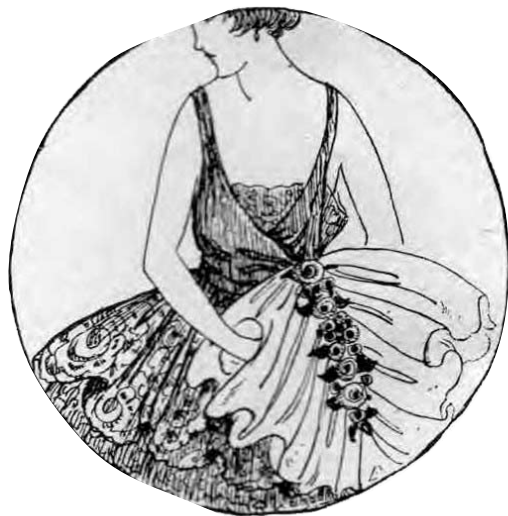
Paris offers a new fancy in a muff of chiffon caught together through the center with a garland of roses. Chez Madeline.